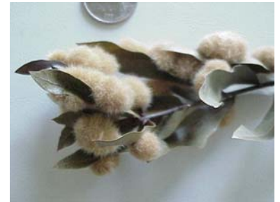
Wooly Oak Leaf Gall

Every year it at this time we start getting a lot of phone calls about little round balls falling out of trees. Sometimes they are fuzzy, and sometimes they are smooth. The fuzzy balls falling to the ground are called woolly oak leaf galls. They are usually attached to the lower surface of an oak leaf and fall off of the leaf. The smooth BB like gall is called the live oak pea gall. When I first encountered these galls I wondered what made them. After a little research, I found out that are many of types of galls on oaks and they can be caused by insects, fungi and even bacteria. The galls we will be learning about in this article are all formed by insects.