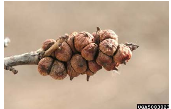
Rough Bullet Gall

Lately we have been seeing a very severe infestation of rough bullet galls on live oaks in commercial plantings. The trees that are severely infested have heavy infestations. It appears that in the most severe cases the tips of heavily infested branches die back. Some researchers are looking into whether or not there are any live oak cultivars that are more or less resistant to rough bullet galls.