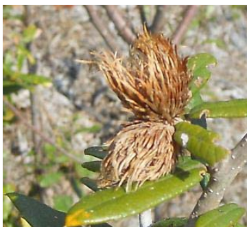
Sara Rall, bugguide.net

The following are common wasp galls found on oaks: