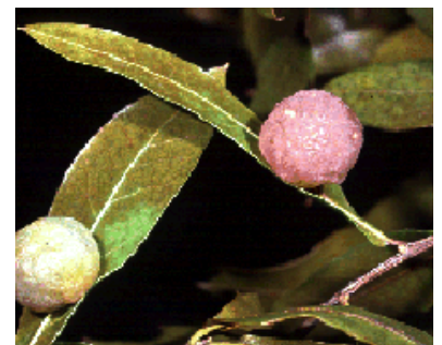
University of Florida

The gall to the right is called an Oak Apple Gall. They are in the genus Amphibolips . They are growths that are filled with a spongy mass. There is one larvae encased in the center of the gall. I once convinced a co-worker that it was the fruit of an oak tree.