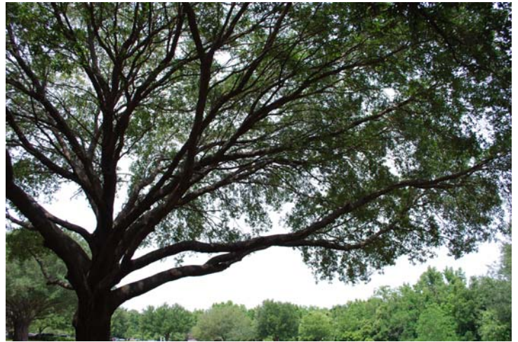
This tree in a commercial office park has been lions-tailed.

The reason why lions-tailing is bad for trees lies in how trees naturally resist wind. A wind resistant tree will have well spaced interior branches that will dampen the effect of wind on the branch as it sways, reducing the amount of sway in the branch. Without those interior branches there is no dampening effect and the branch sways wildly back and forth in high winds making it more likely to break. One forester describes the effect of lions-tailing on a branch like this: “Stick your arm out the window while riding in a car and open up your hand with the palm facing the wind. This is what a tree branch is like when it is lions-tailed” .