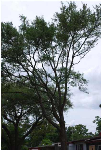
A residential tree that has been lions-tailed.