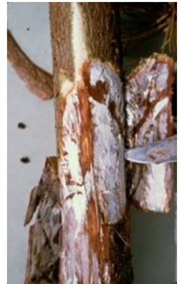
White fungal mycelia fan of Armillaria

This disease is not treatable with a fungicide. You may have many plants that are affected, but not die right away until they are really stressed normally by environmental factors such as temperature or humidity changes. It is best to remove infected plants and replace them with healthier ones. For more information on Armillaria Root Rot, visit Gardening in a Minute http://gardeningolutions.ifas.ufl.edu/giam/problems/diseases_and_pests/mushroom_root.html to access publications or listen to a radio show about the disease.