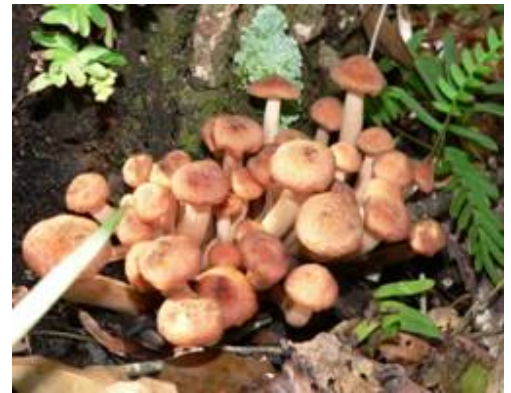
Mushrooms produced by Armillaria

Mushroom Root Rot or Armillaria is a disease that affects many woody landscape plants. Symptoms range from wilting to death. You may notice dieback either in sections or on the entire plant. Symptoms can appear quickly, but often they develop slowly over time. Mushrooms are normally observed at this time of year (photo right), but not always. This fungal disease can kill most ornamental plants and is particularly damaging to stressed plants. This pathogen can also affect small woody shrubs and trees such as laurel oaks and sweet gums.