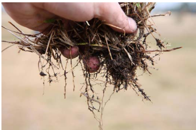
Photo 3. Roots lack root hairs and are brown and mushy.