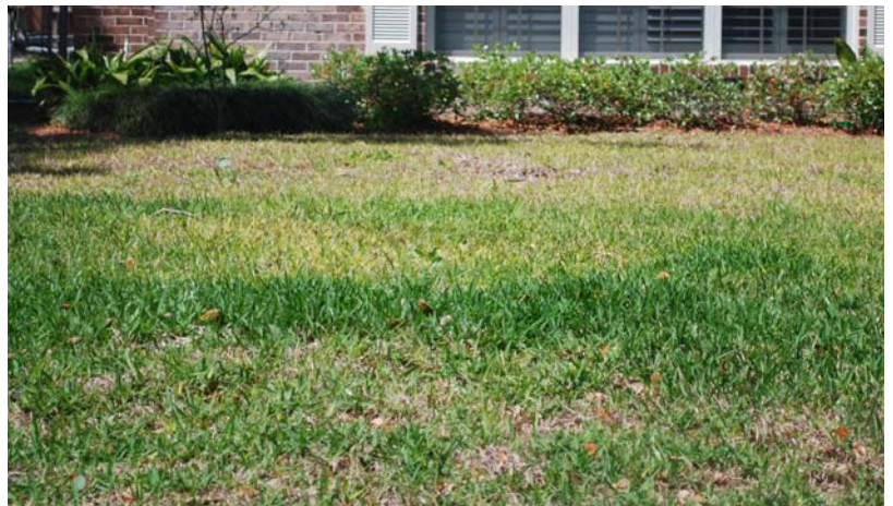
Photo 1. Symptoms of Take-all Root Rot including yellowing and thinning.